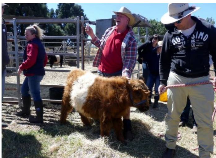
Above: Learning to vaccinate

First up on the afternoon agenda . . . tattooing, with everybody getting a chance to see the equipment used, and how to work it. We pointed out importance of first testing your tattoo on a piece of cardboard to make sure that you didn't have a letter or number in the wrong place. Plenty of green tattoo ink was used to highlight the need to really rub the ink into the piercings.