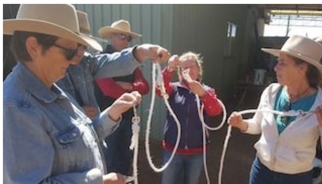
Above: Learning how to make rope halters and lead ropes.

We demonstrated how to apply a NLIS tag. The large vein in the ear was pointed out as something to avoid.