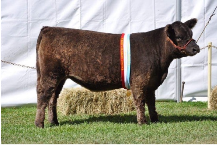
Above: Tumblegum Gemima, 14 months. The Dunks made a successful show ring debut with this beautiful heifer.