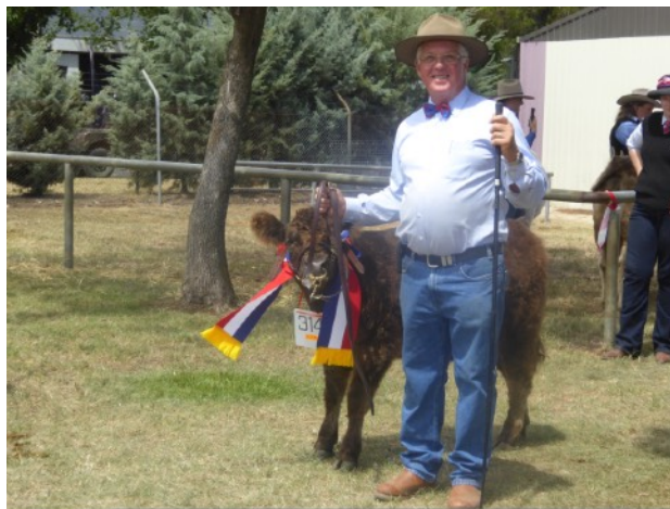
Below: 'Tumblegum Audrey' Supreme Champion Bungendore.