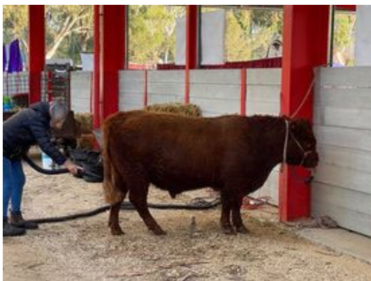
Balytyckle Quill Starlord enjoying a spruce up before the visitors arrive