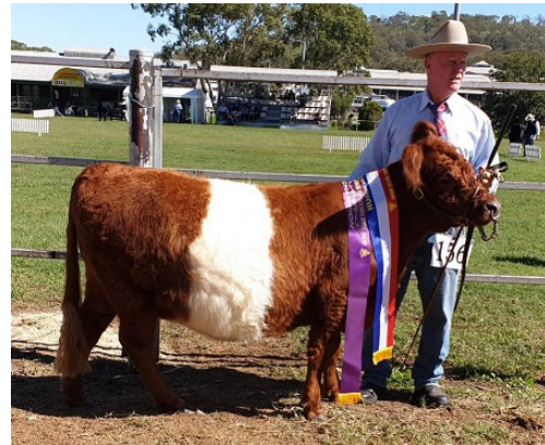
Freedom Rise Quincy with Raymond Cross

Senior and Grand Champion Female Freedom Rise Quincy