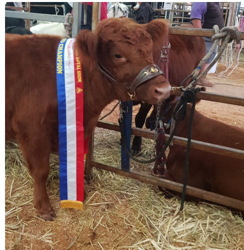
MT Davidson Roo-Ann Queen of Scots