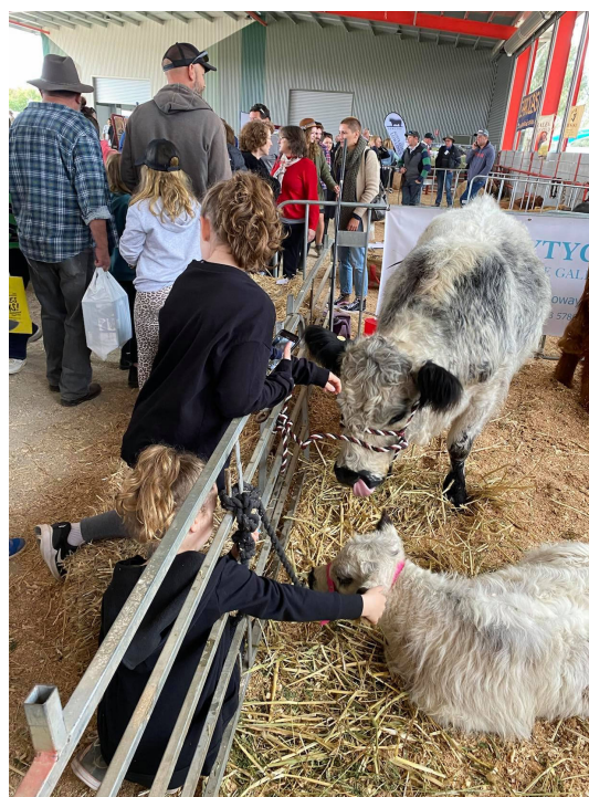
Tumblegum Bonnie Jean and Balytyckle Sequin enjoy pats from young attendees.

heifer calf Balytyckle Sequin settled well and considering this was their first ever outing we were very pleased with them. There was a slight hiccup when we arrived the morning after the first night to the overnight shed attendant informing us of 'construction earthworks' happening in our stalls! 'Quill' had decided he had had enough and set about digging his way home!! The shed attendant thought it was hilarious; we on the other hand had a rather large hole to fill in before we could get to our other chores! Lesson learnt . . . remember to bring the bull mat even when you don't think you will need it!