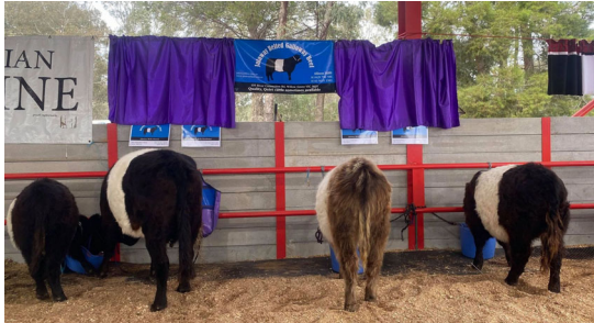
Jalaway cattle clean and ready to face the crowds

It was a great weekend, lots of laughs and companionship during the time from Galloway Family and all the other cattle exhibitors.