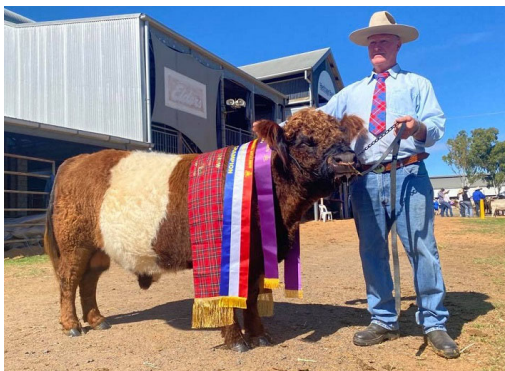
Eagle Ridge Picasso with Raymond Cross

Senior and Grand Champion Bull Eagle Ridge Picasso