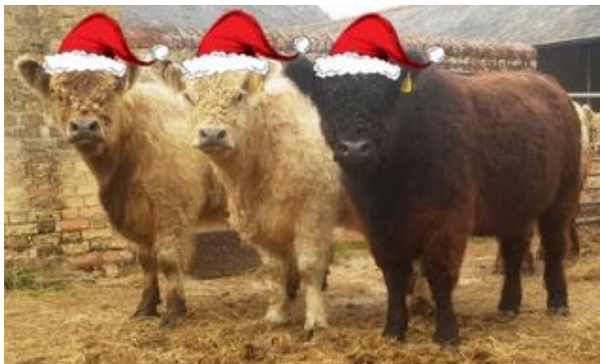
taken on one of his many trips to the home of Galloway cattle . . . . Scotland.