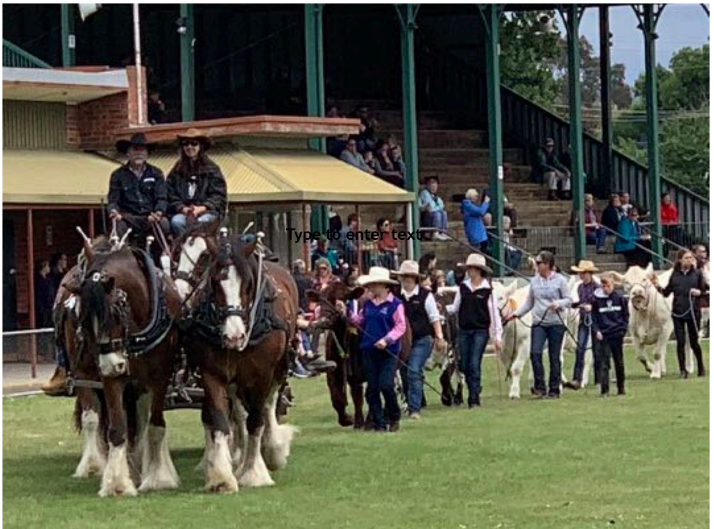
Above: YEA show in Victoria, largest cattle entry at this country show for quite some time! A wonderful friendly atmosphere and it was great to see so many young handlers.