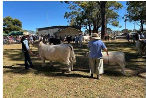
Torcroft Kristina with Torcroft Viola