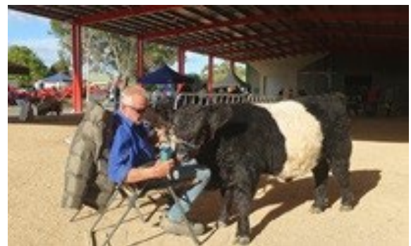
Ready for home after three busy days at the Expo