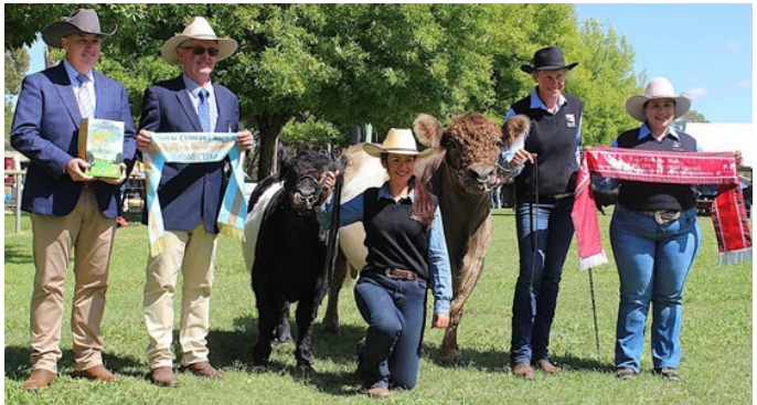
Supreme Belted Galloway Silvan Park Smokie and calf Silvan Park Viking