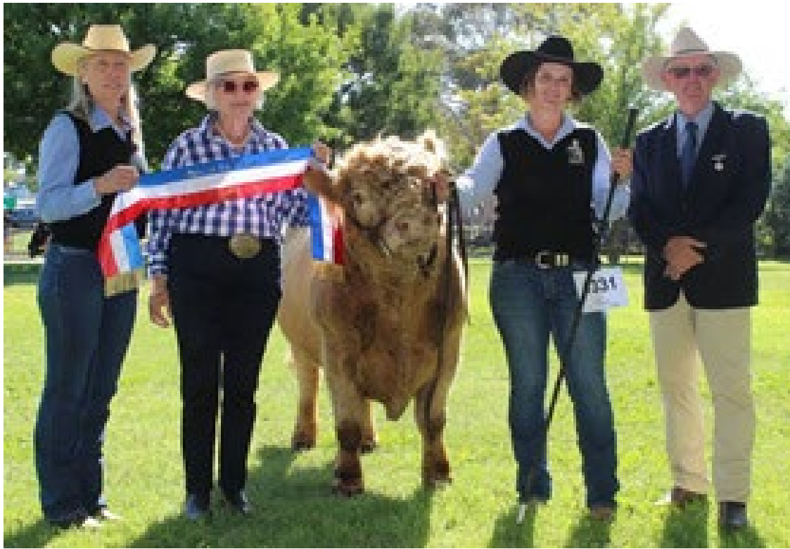
Balytyckle Top Gun KOW T8 Senior and Grand Champion Miniature Galloway or Miniature Belted Galloway Bull