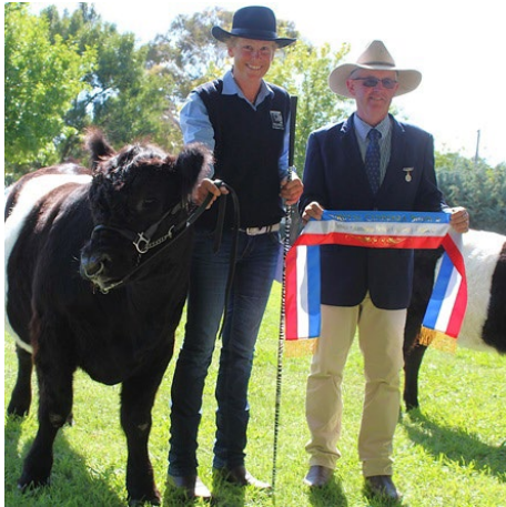
Silvan Park U-Bute SP U12 Junior Champion Belted Galloway Female

Belted Galloway Female 20 months & not over 24 months