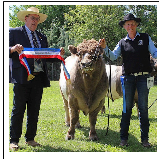
Silvan Park Top Gun SP T60 Senior and Grand Champion Belted Galloway Bull

Reserve Senior Champion Belted Galloway Bull