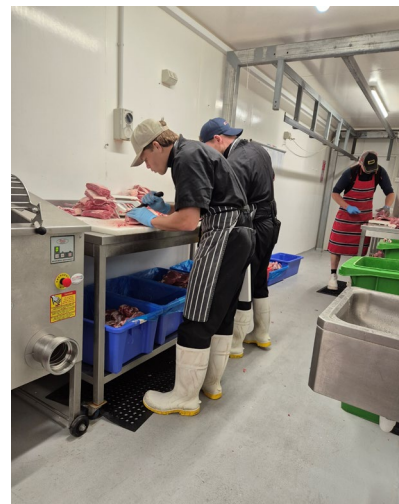
Lamb Processing at the abattoir

We both enjoyed meeting and talking to different breeders from different countries.”