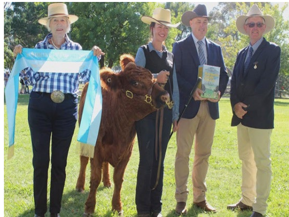
Supreme Miniature Galloway and Miniature Belted Galloway Barmaroo Stud's Oakvale Ullabella Ruby LRR U3