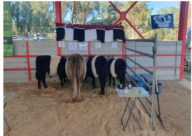
The Silvan Park team sparkling clean ready